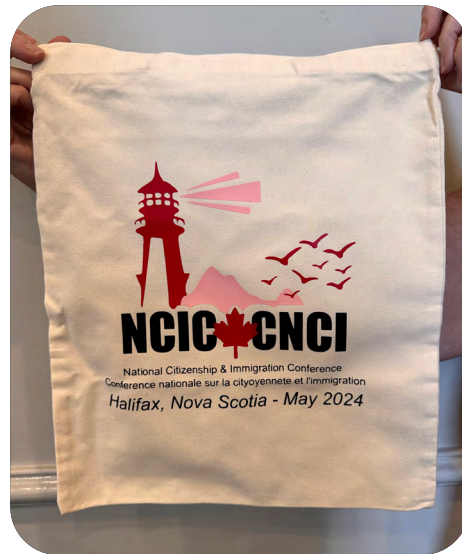
2024 Tote Bag